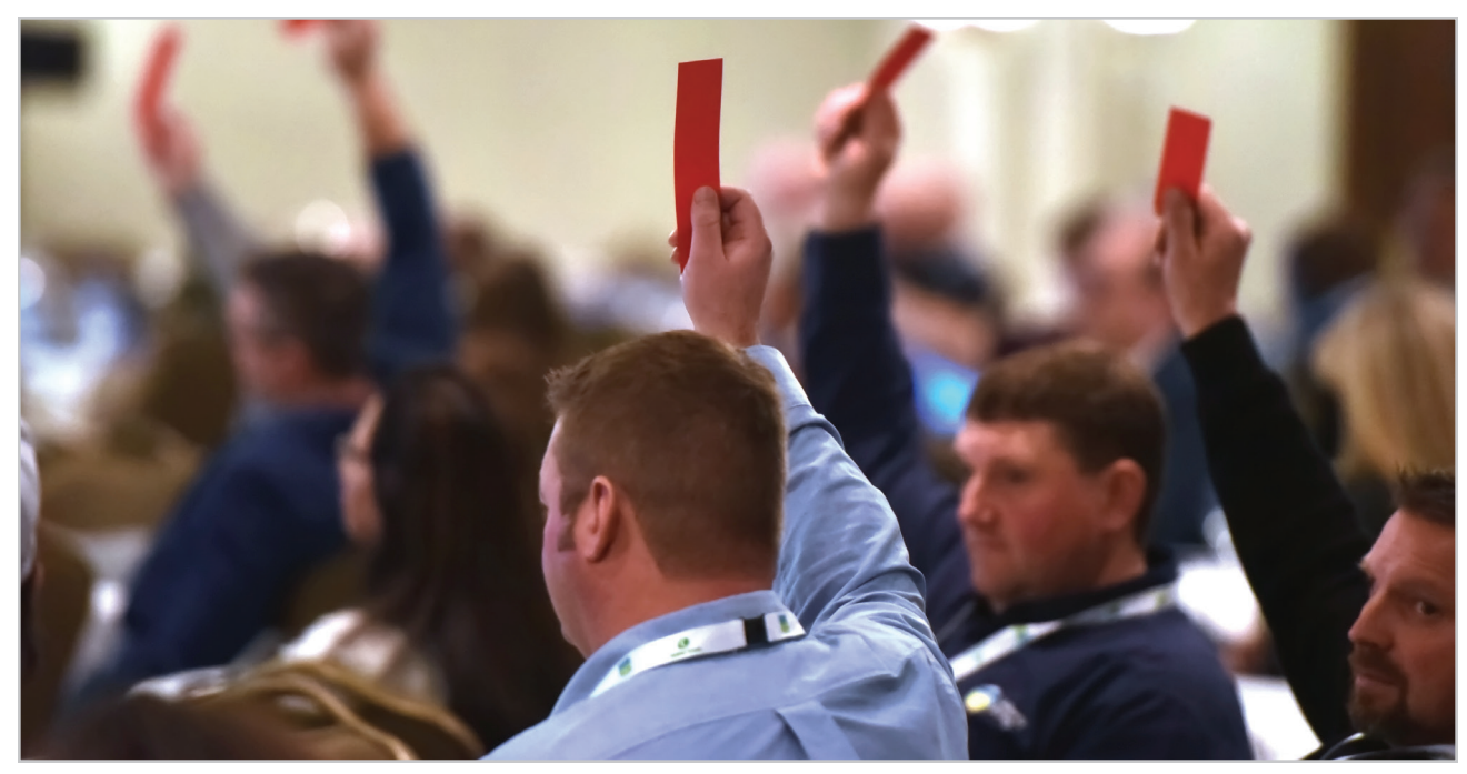
Farmers voted on resolutions at the Alberta Barley Annual General Meeting held at the Prairie Cereals Summit in December of 2022.