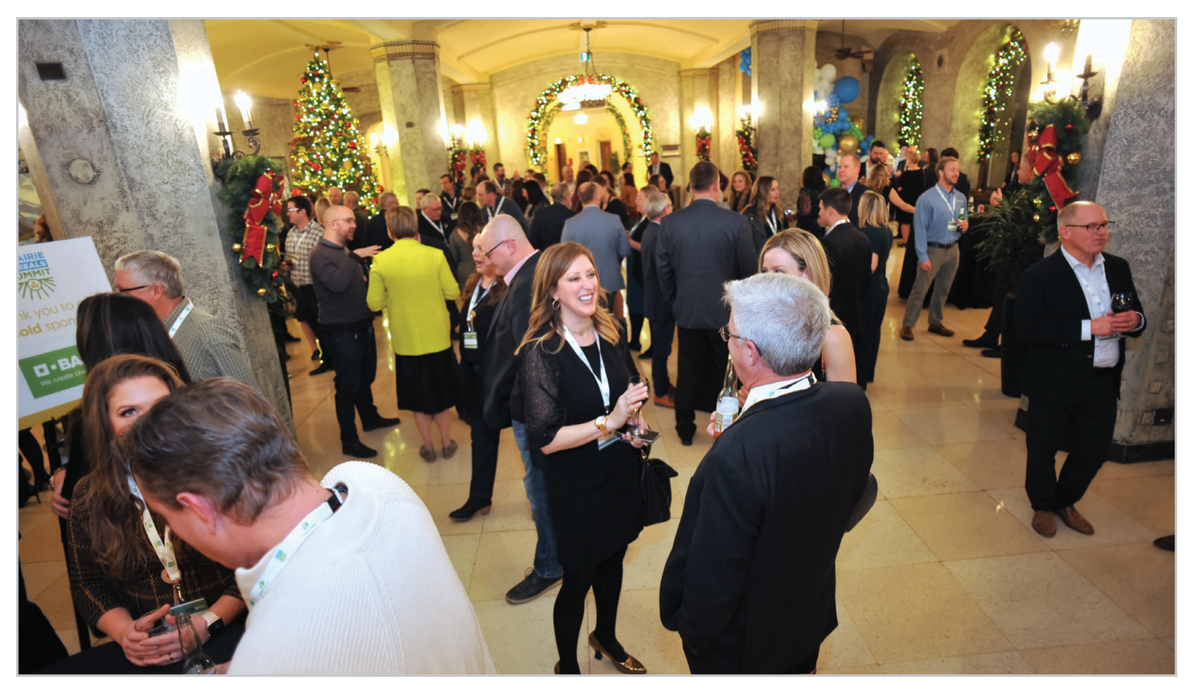
Prairie Cereals Summit attendees networked at the BASF sponsored reception held in the Riverview Lounge at the Banff Springs Hotel.