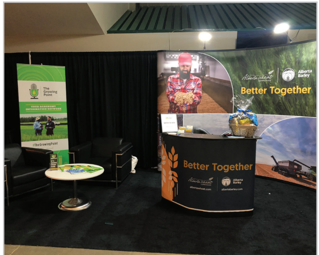
At this equipment expo and social event, Agri-Trade attendees visited the new Alberta Wheat and Barley commissions' booth to reconnect with farming friends and neighbours.