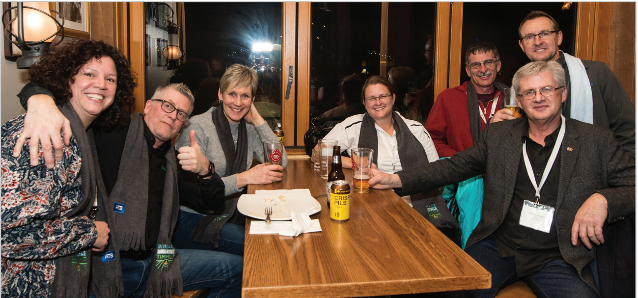
The Prairie Cereals Summit pub tour featured great times, laughs and many networking opportunities for attendees from across the Prairies.

Alberta Barley and the Alberta Wheat Commission (AWC) held their annual conference at the Fairmont Banff Springs Hotel on Dec. 11-12, 2019 with a great lineup including Stockwell Day, Danielle Smith and a panel discussion on grain transportation. This must-attend event was better than ever, with over 275 farmers and industry members sharing ideas and laughs over two days in the Rockies.