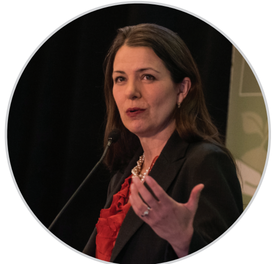
Radio host and political commentator Danielle Smith presented a postmortem analysis of the 2019 federal election.