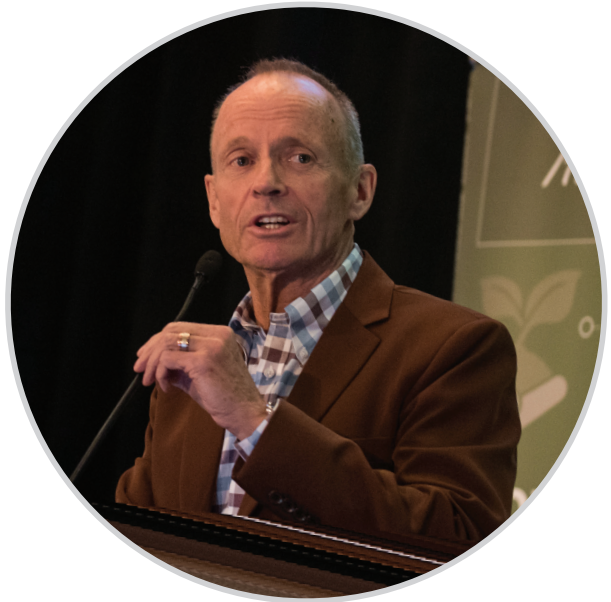
Former politician Stockwell Day delivered a timely talk about China and international trade.