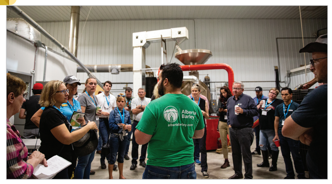
Joining brewers on the tour, representatives of the entire barley value chain included seed companies, researchers, maltsters and exporters. This variety of industry experience provided attendees with insight and networking opportunities.