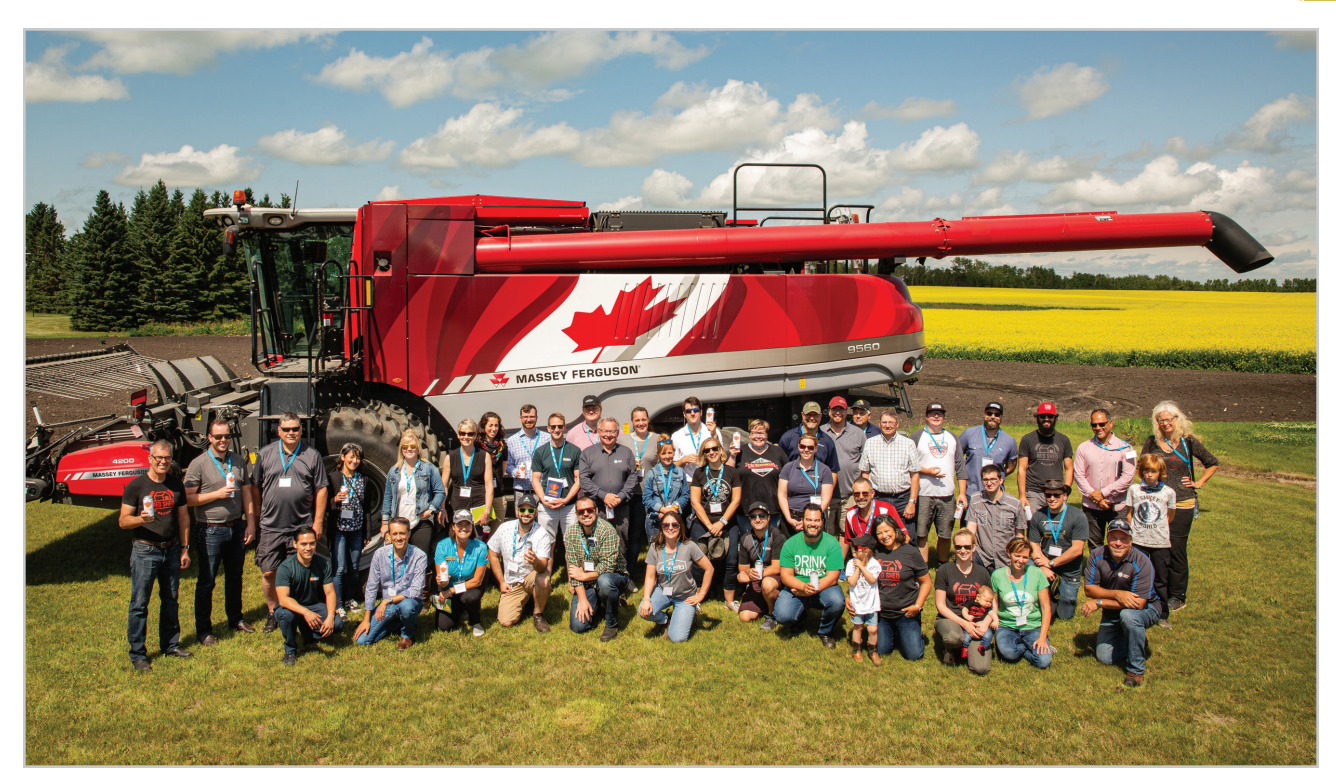
{\it Made in Canada Crop Tour attendees visited three farms, Red Shed Malthouse and the provincial Field Crop Development Centre.}