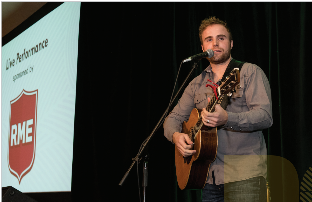
Topping off the evening's festivities, country music star Adam Gregory took the stage for a solo performance.