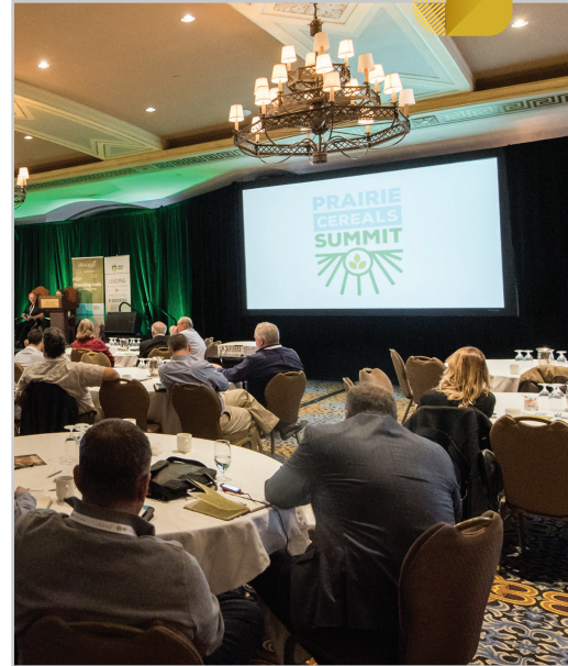
The Prairie Barley Summit has been rebranded as the Prairie Cereals Summit. The sold-out event was attended by wheat and barley farmers and other ag industry professionals.