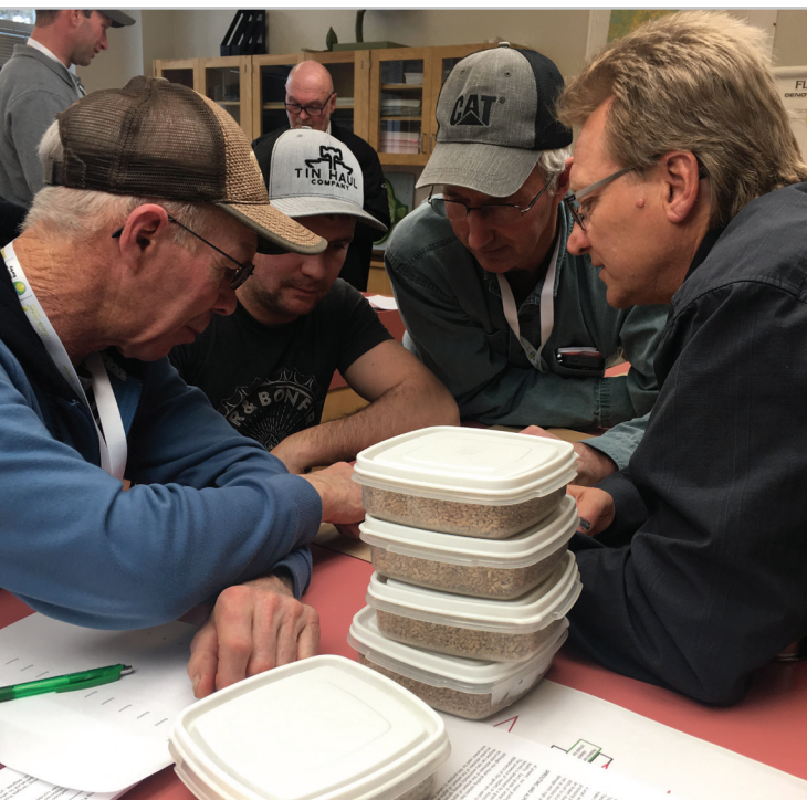
Farmers attending Making the Grade team up to closely inspect and visually grade samples of wheat.

As a collaborative event presented by Alberta Barley, the Alberta Wheat Commission, Alberta Pulse Growers and Alberta Canola, Making the Grade has become a hit with Alberta farmers. Focused on wheat, barley, canola and pulses, the full-day event held Dec. 18, 2018, at Olds College saw grain-grading professionals conduct rotating, hands-on learning sessions with attendees.