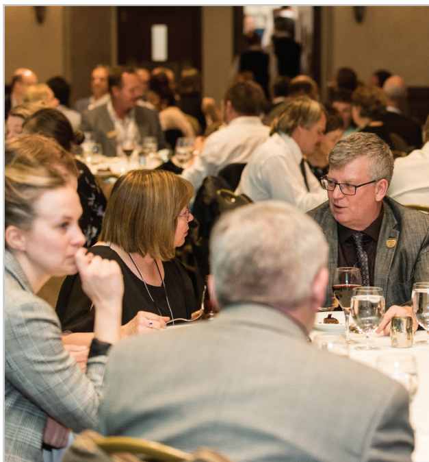
Wrapping up the inaugural Prairie Cereals Summit, attendees filled the hotel's Alhambra Room for a banquet dinner and live entertainment.