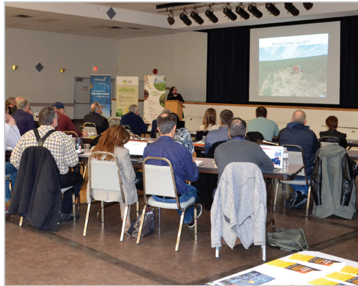
Local farmers attend the Next Level Farming meeting held in Westlock, on Nov. 21, 2018.