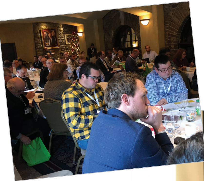
At the meeting, Alberta Barley directors, delegates and farmers discussed annual commission updates and decision-making items.