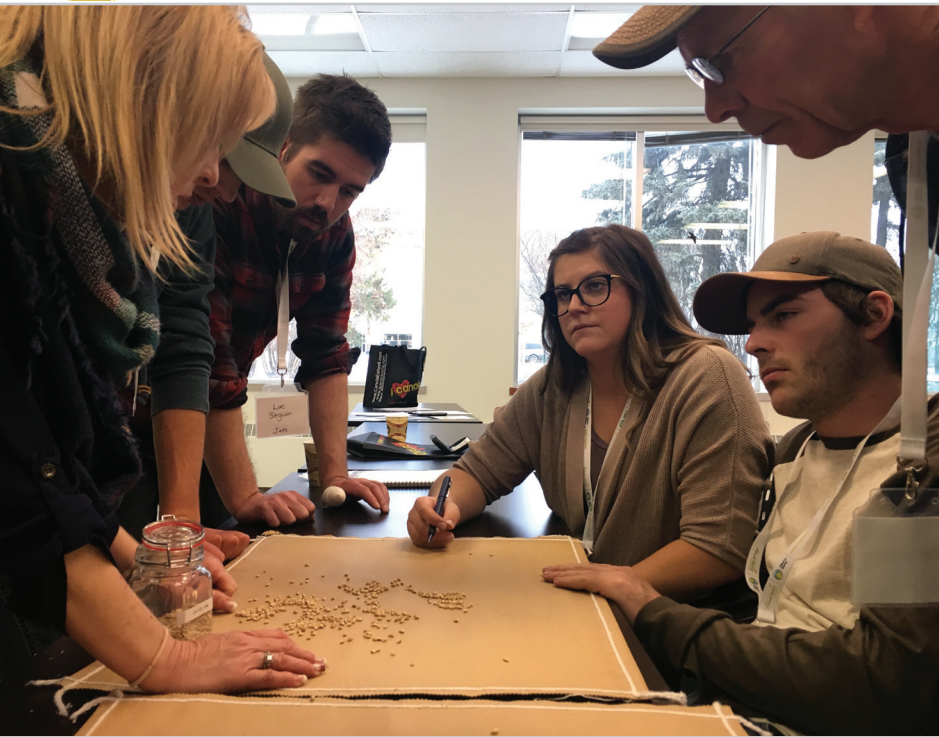
Making the Grade attendees benefitted from a hands-on experience and close interaction with grading experts.