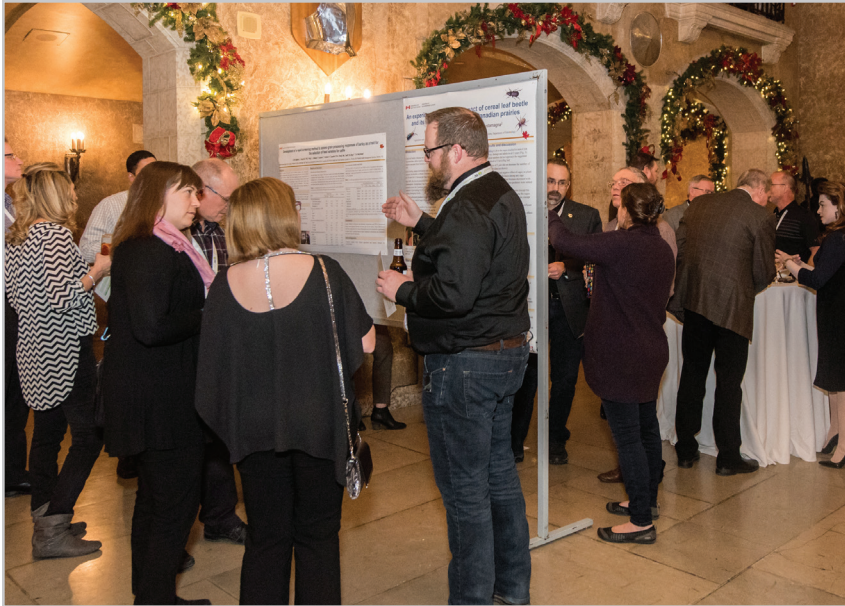
Select researchers had the opportunity to share their findings with conference guests in the grand setting of the Fairmont Banff Springs.