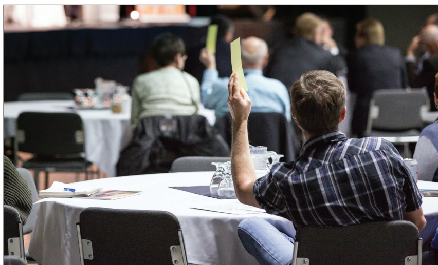
Voting at Next Level Farming is one way to have an impact on the future of your crop commissions.