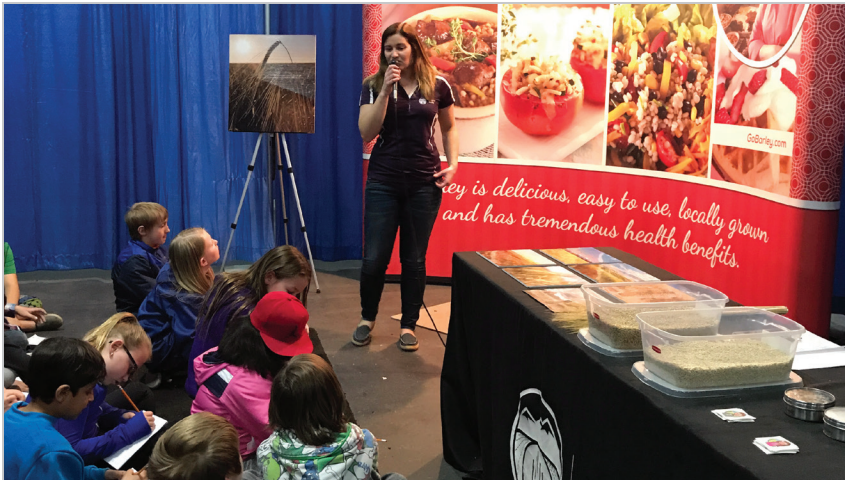
Amazing Ag in Edmonton, May 1-4, 2017: This annual classroom-style learning experience for children of all grades gives a great understanding of barley and the industry at large.