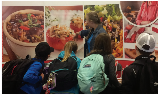
Aggie Days Calgary, April 5-9, 2017: More than 4,000 kids attended one of our biggest educational events of the year to learn about Alberta's rich agricultural sector and the importance of barley.