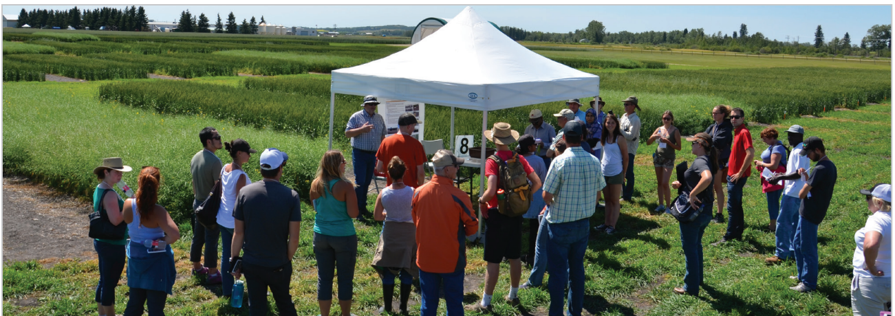
Lacombe Field Tour, July 26, 2017: Alberta Barley supports many research projects across the province. At field days such as the Lacombe Field Tour, farmers discover what these projects are and how they will be of benefit to their operations.