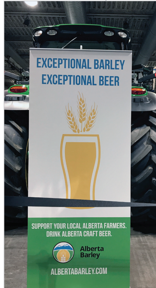
Calgary International Beerfest, June 2-3, 2017: Brewing exceptional beer requires exceptional barley. At one of our largest consumer events, we educate consumers about the connection between the beer in their glass and the barley in Alberta's farm fields.