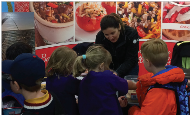
Aggie Days Lethbridge, April 25-26, 2017: The sister event to Aggie Days Calgary, this was another fun and educational gathering at which children gained an appreciation for farm life and how our crop is crucial to the livestock sector.