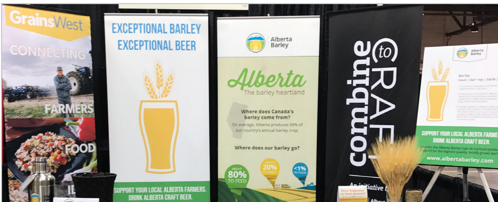
Edmonton Craft Beer Festival panel, June 2-3, 2017: Similar to Calgary Beerfest, our seminar at the Edmonton Craft Beer Festival focused on the story of barley from combine to craft.